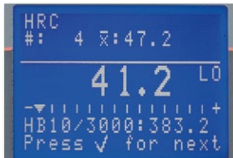
Results, average and conversion