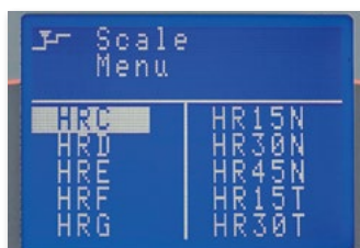
Set of the hardness test methods

The AFFRI software controls the whole instrument during the entire cycle avoiding human errors. The tester can easily be used by operator of every level.