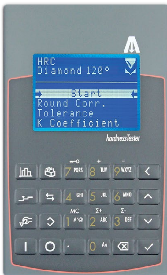
Touch key pad board IP 64 protection

Data output via RS 232 C for connection to printer and computer for diagram plotting and statistics. Hyperterminal is needed. Available USB adapter.