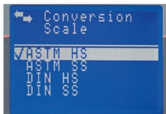
Conversion scales tables