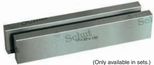
(Only available in sets.)