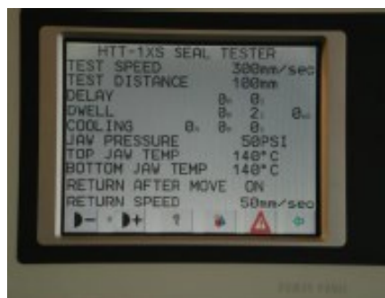
Setup screen, password protected