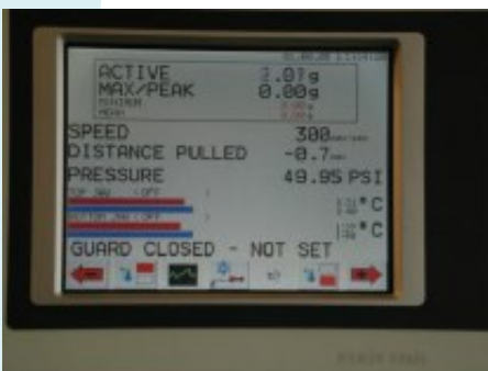
Default screen showing results and settings

Options available: Crimp jaws 25 x 50mm, 120 deg x 1.8mm pitch. Teflon coating to sealing jaws. Silicone rubber covered lower jaw. Drop weight set.