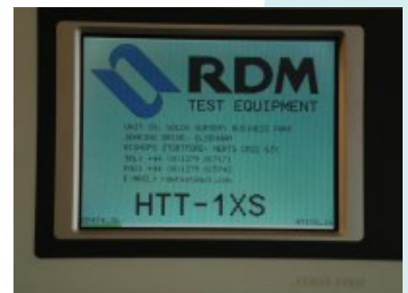
Boot up screen showing model and version