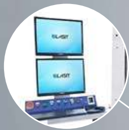
DOUBLE SCREEN (OPTIONAL)