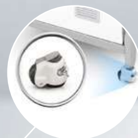
CASTERS FOR EASY MOVEMENT OR RELOCATION OF THE MACHINE WITH PERFECT STABILITY (OPTIONAL)