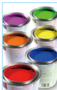
Paint & Ink