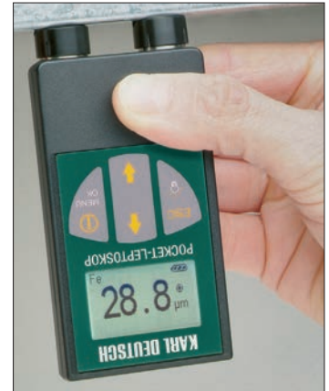
Flip display: easy to read even when measuring overhead