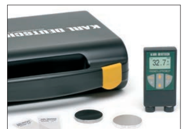
Pocket-LEPTOSKOP with accessories