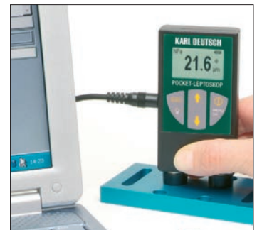
Serial PC interface