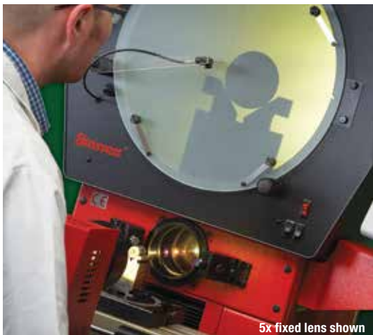
5x fixed lens shown