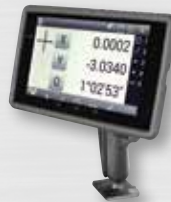
Clockwise from the top: MetLogix™ M3 Quadra-Chek® QC221 MetLogix™ M1