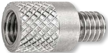
Female to Male Thread Adapters