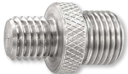
Male to Male Thread Adapter