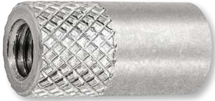
Female to Female Threaded Couplers