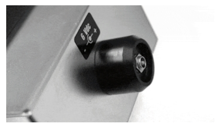
Battery with INSTAPLUG innovative quick coupling wireless system.