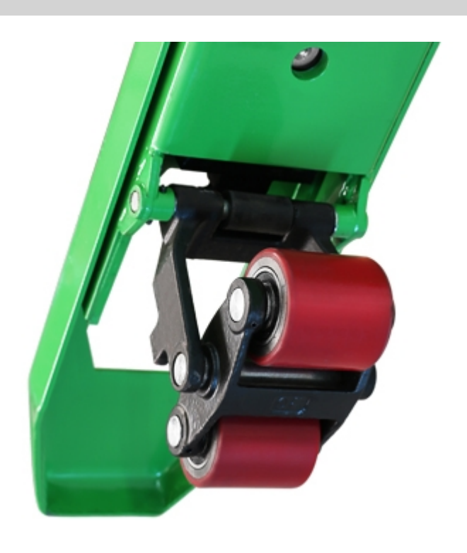
Closed Forks underside, for a higer protection against dirt.