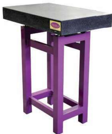
DH plate with DS Support