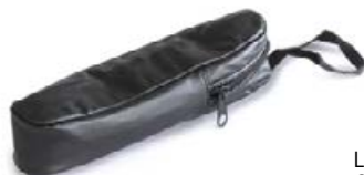
Leather bag ORA-A2103