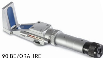
ORA 90 BE/ORA 1RE