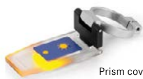
Prism coverplate with LED ORA-A1101