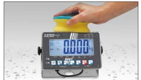
Stainless steel display device with protection IP68, hygienic and easy to clean