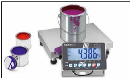
Durable stainless steel weighing plate