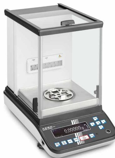
2 KERN ABP 100-5DM with optional ioniser